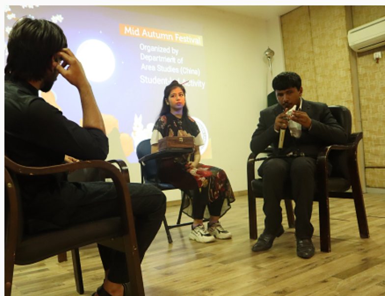
STUDENTS WHILE PERFORMING IN A DRAMA