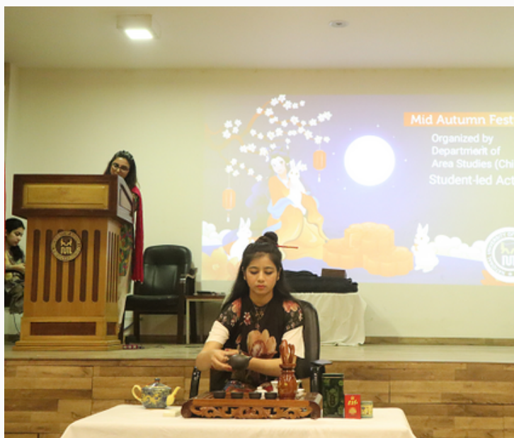
CHINESE TEA MAKING BY STUDENT OF AS-1ST SEMESTER