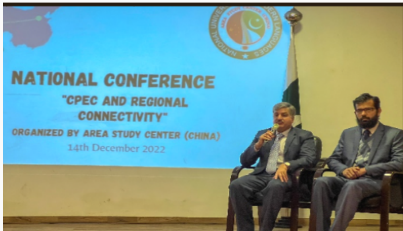
DISCUSSION PANEL AT THE END OF THE NATIONAL CONFERENCE