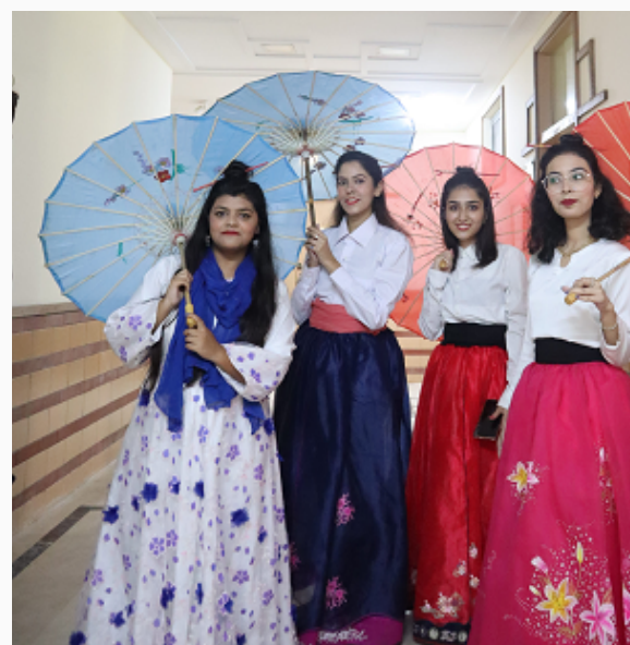
FACULTY AND STUDENTS ATTENDING THE MID-AUTUMN FESTIVAL