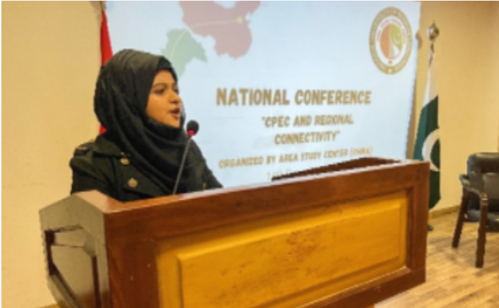
STUDENTS FROM BSAS PERFORMED AS A SPEAKER IN NATIONAL CONFERENCE