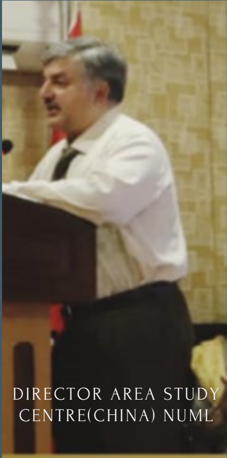
DIRECTOR AREA STUDY CENTRE(CHINA) NUML

Mid-Autumn Festival, or Mid-autumn Day, is the second grandest festival in China after the Chinese New Year. It is named so for that it is celebrated on the 15th day of the 8th lunar month, which is always in the middle of the autumn season in China. The day is also known as the Moon Festival, as at that time of the year the moon is believed to be at its fullest and brightest and Chinese always worship the moon and appreciate the full moon on that day.